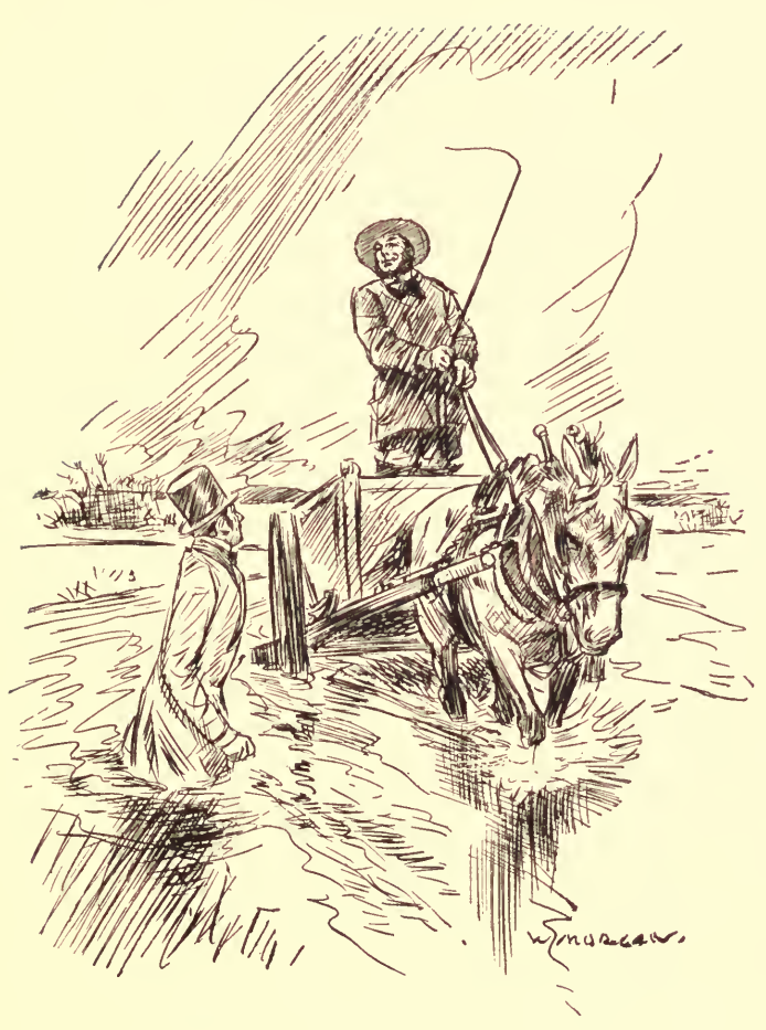
""Say,' he cried, 'I'm cruisin' your way; better get aboard, hadn't you?""